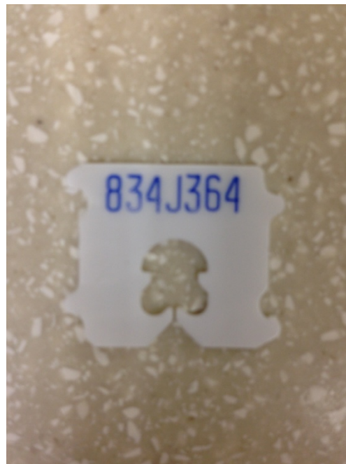
Bread Clip Lot Number: